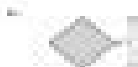
FIGURE 5 10 cm 8 cm